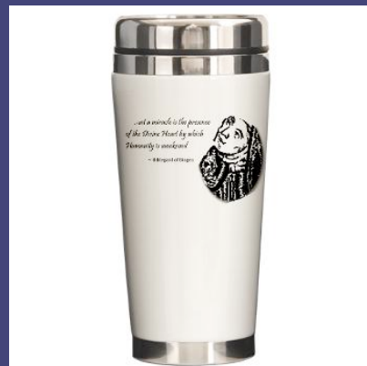
ceramic travel mug