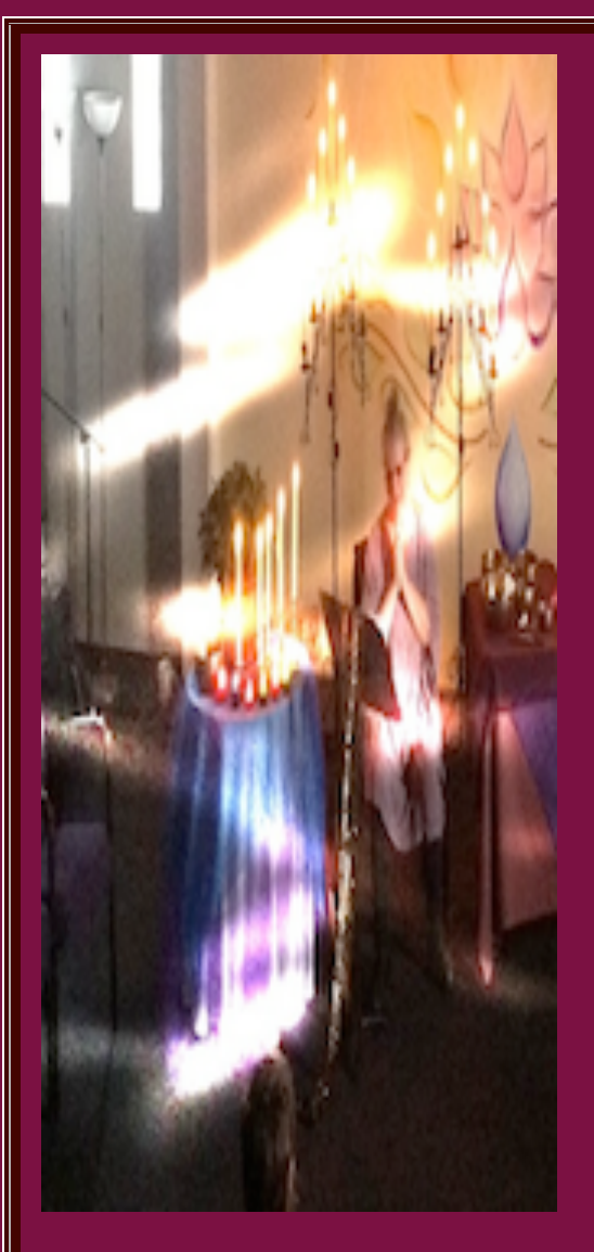
photo taken during last year's concert - listen and watch what happened now