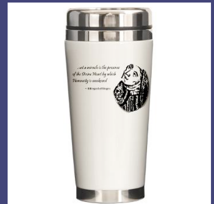
ceramic travel mug