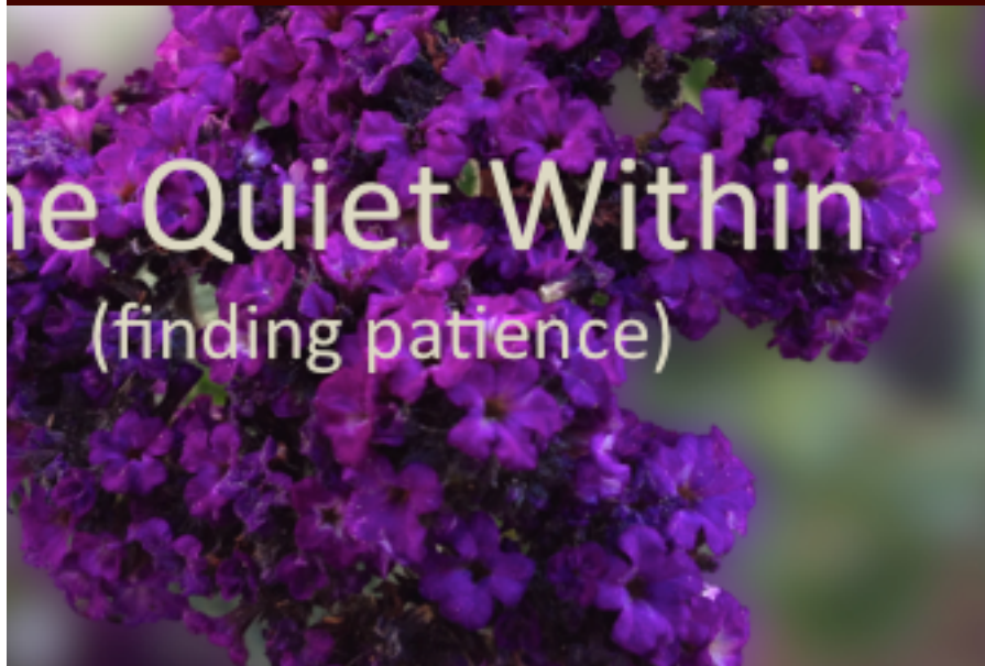
Song for Patience