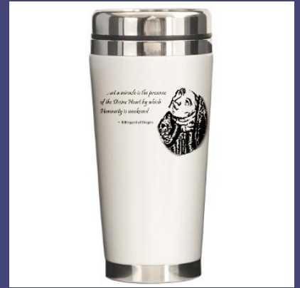
ceramic travel mug